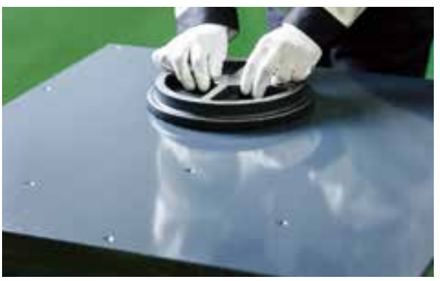
Mitutoyo has introduced the Takumi Meister System to pass on outstanding skills of artisans.